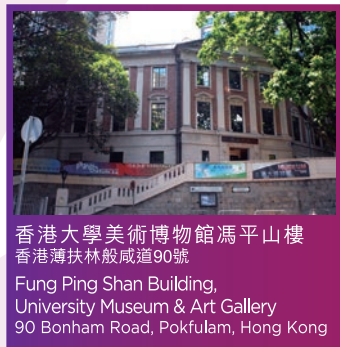
香港大學美術博物館馮平山樓 香港薄扶林般咸道90號 Fung Ping Shan Building, University Museum & Art Gallery 90 Bonham Road, Pokfulam, Hong Kong

One of China's most influential rulers and a great champion of the arts, Emperor Qianlong's epic 60-year reign (1736-1795) was considered a golden age of China, especially in the fields of literature, religion, architecture, and fine art. Meanwhile, Europe's most prodigious musical genius, Wolfgang Amadeus Mozart, was delighting European royalty and society with a constant stream of stunningly inventive musical output. Written in 1789, Mozart's Quintet in A major for Clarinet and Strings, K. 581, is considered the finest example for this instrumental configuration. The quintet is followed by the Andante Cantabile from String Quartet No 1 by Pyotr Ilyich Tchaikovsky, a composer associated with another imperial power, Russia.