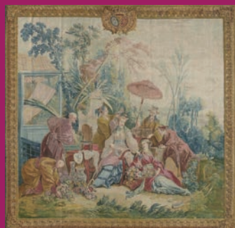
The Chinese Garden (Le Jardin chinois or La Toilette chinoise)

D大調第一弦樂四重奏: 「如歌的行板」(第二樂章) Andante Cantabile from String Quartet No. 1 in D (second movement), Op. 11